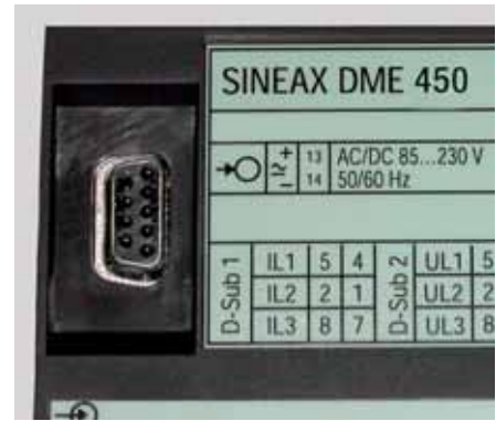
The RS 232 programming interface also supports the connection of the SINEAX A200 display unit.