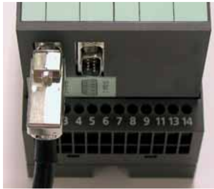
2 plug connectors (9-pin D-SUB) each for 3 low voltage signals from electronic current and voltage transformers.